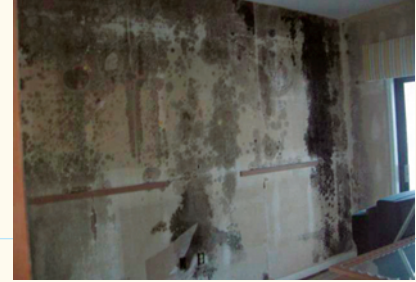
Fig. 1 Appearance of mold on drywall.

Mold is a natural part of the environment. Molds are forms of fungi found year round both indoors and outdoors. Mold growth is encouraged by warm and humid conditions, although it can grow during cold weather. There are thousands of specimens of mold and they can be any color. Most fungi, including molds, produce microscopic (2 to 10 \mu\text{m} ) reproductive cells called spores. These spores typically disperse through the air continually and settle on all building surfaces, where they can remain dormant for years. Given the right circumstances, they may begin growing and digesting whatever they are growing on in order to survive. There is no feasible or cost-effective method to completely eliminate fungal spores from the indoor environment.